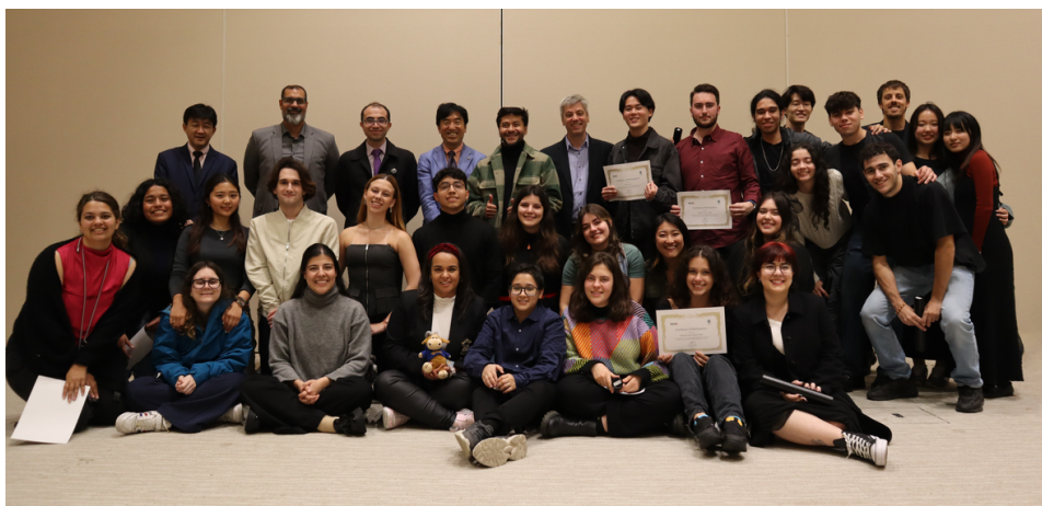
SEED Participants in Certificate Event

Associate Professor at Los Andes University, Colombia