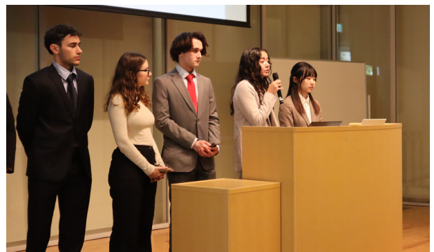
Sake Team Presentation