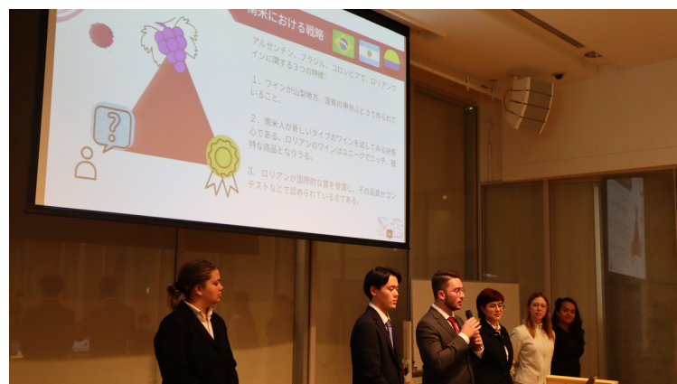
Wine Team Presentation

The event began with an opening speech by the Representative Director of GOROM Association, followed by speeches delivered by university advisors, and the core of the event was the pitch presentations made by the students of the SEED Program. Each of the four groups -Sake, Wine, Jewelry and Textile- had 20 minutes to present their pitch to the audience, explaining about their findings and market research, as well as describing their proposed ideas and strategies to answer to the requests made by their respective producer.