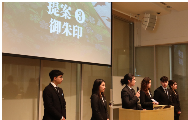
Textiles Team Presentation

The event took place on Friday, December 8th in Yamanashi Prefectural Library. Among the audience that filled the venue, local and regional government officials, local producers and program sponsors were present. It is worth mentioning that for a second consecutive year, the SEED Program's Public Pitch Event received national TV coverage by NHK and was covered as well by the local newspaper Yamanashi Sannichi Shinbun.