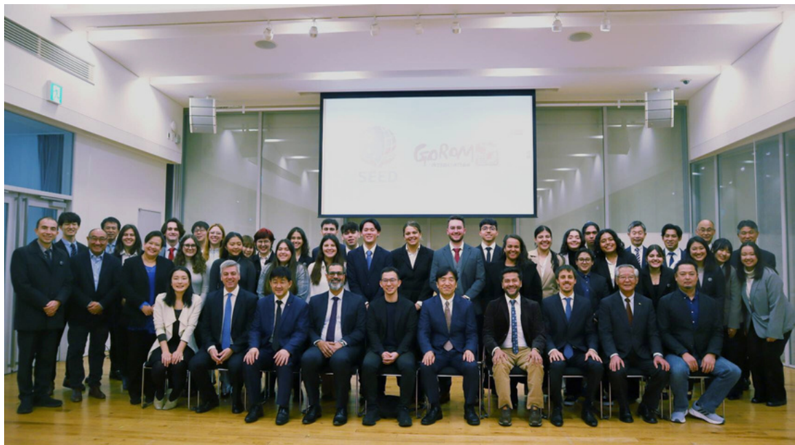
Group Picture at Yamanashi Prefectural Library