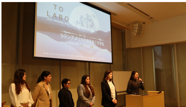
Jewelry Team Presentation

The presentations were exhibited in both English and Japanese: Latin American students spoke in English, while Japanese students in each group provided oral translations in Japanese. Moreover, the presentation slides projected on a big screen were in Japanese too. These slides provided insightful information for the audience, such as demographic charts, trend graphs, pictures, written explanations, and more.